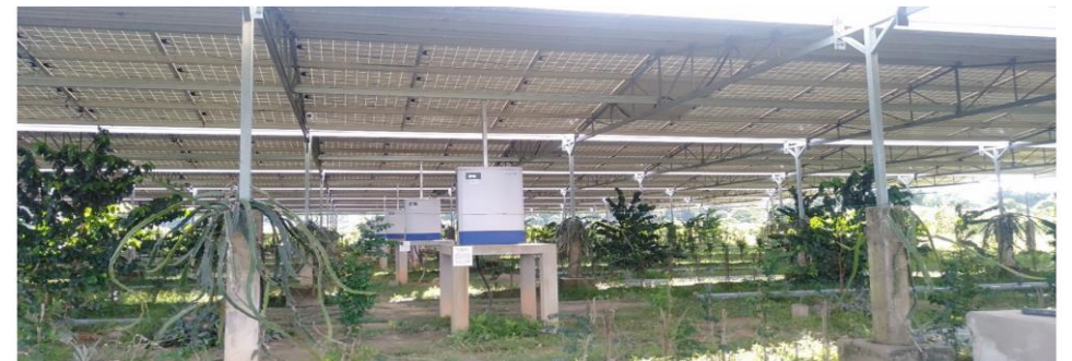
1 MWp Solar Farm at Keningau under DASB