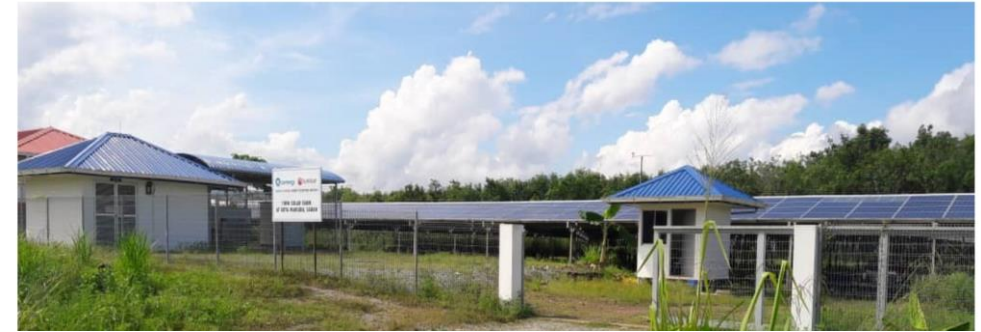
1 MWp Solar Farm at Kota Marudu under MPSB

For DASB and MPSB, solar panels are installed on roof that covers agricultural farms, which grows crops with the likes of yam, spinach, and lemon grass. Each solar plant has an agriculture contractor that serves to take care of the crops in order for the companies to qualify for the additional bonuses. Throughout this initiative, Cenergi also plays a role in helping the locals to generate additional income to improve their livelihood.