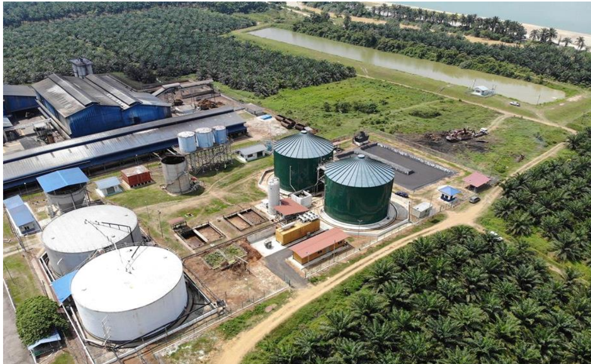
TENNAMARAM 1.6 MW Biogas Power Plant